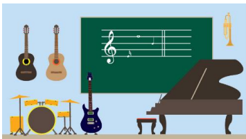
4. music room