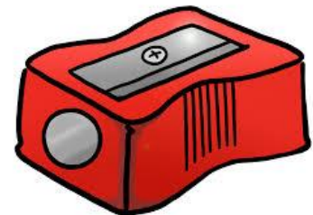
6. pencil sharpener